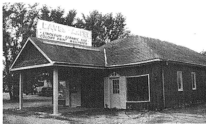
The exterior of Love INC Heartland's new home. We'll get right to work on a new sign.

Love INC Heartland is a 501c3 charitable organization which combines the efforts of 13 churches serving the communities of Delano, Howard Lake, Maple Plain, Montrose, Rockford, Watertown and Waverly. Our mission is to respond to our neighbors in need and to empower and transform our communities through the love of Christ. Member churches are Delano: Delano Evangelical Free, Delano United Methodist, Light of Christ Lutheran, St. Paul's United Church of Christ; Howard Lake: St. John's Lutheran; Maple Plain: Faith Community, Maple Plain Community, Village Evangelical Free; Rockford: Our Father's Lutheran, Riverwood Covenant; Watertown: Trinity Lutheran, Watertown Evangelical Free; Waverly: St. Mary's Catholic.