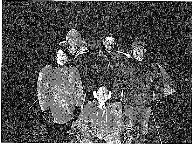
Pastors sleep out to raise awareness.

Donations are still being collected toward our $50,000 goal.